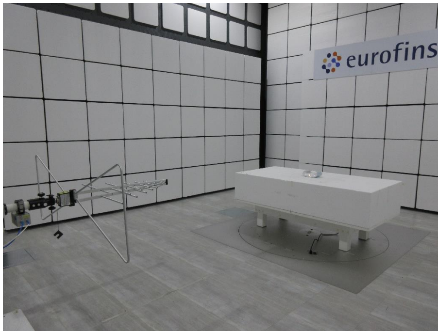
Below 1 GHz _ Rear View