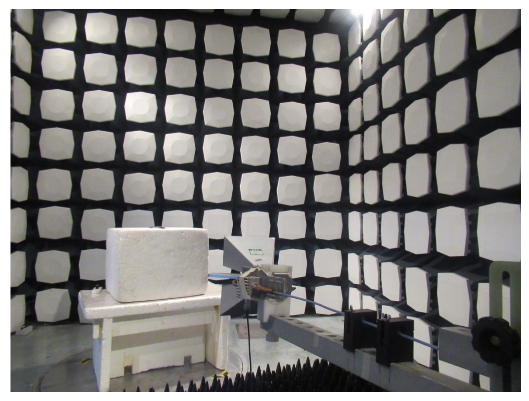
1GHz-18GHz Picture 1: Radiated Spurious Emissions Test setup