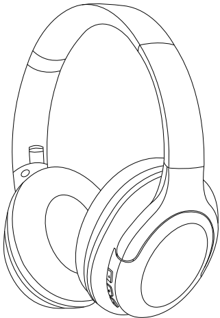
ANC100 User Manual

Congratulations on your purchase and thank you for your use of our Bluetooth Active Noise Canceling Headphone. In order to start quickly, please read the user guide carefully.