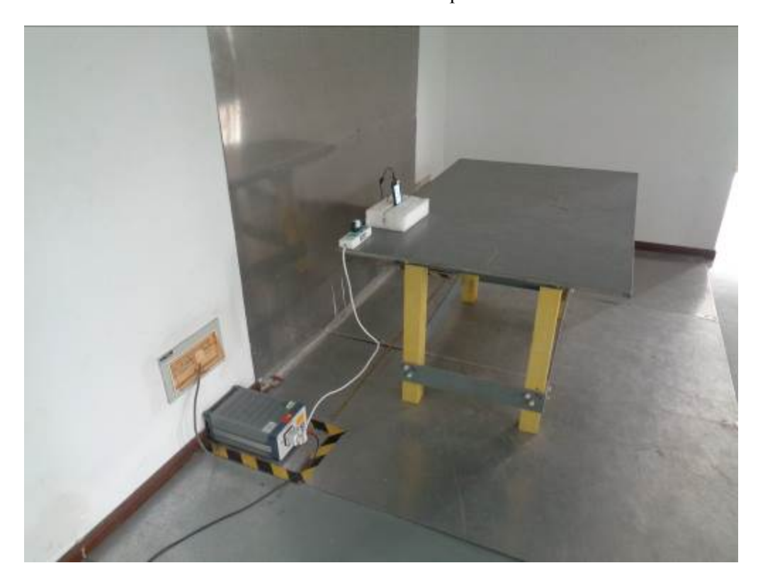
Conducted Emissions Test Setup – Side View