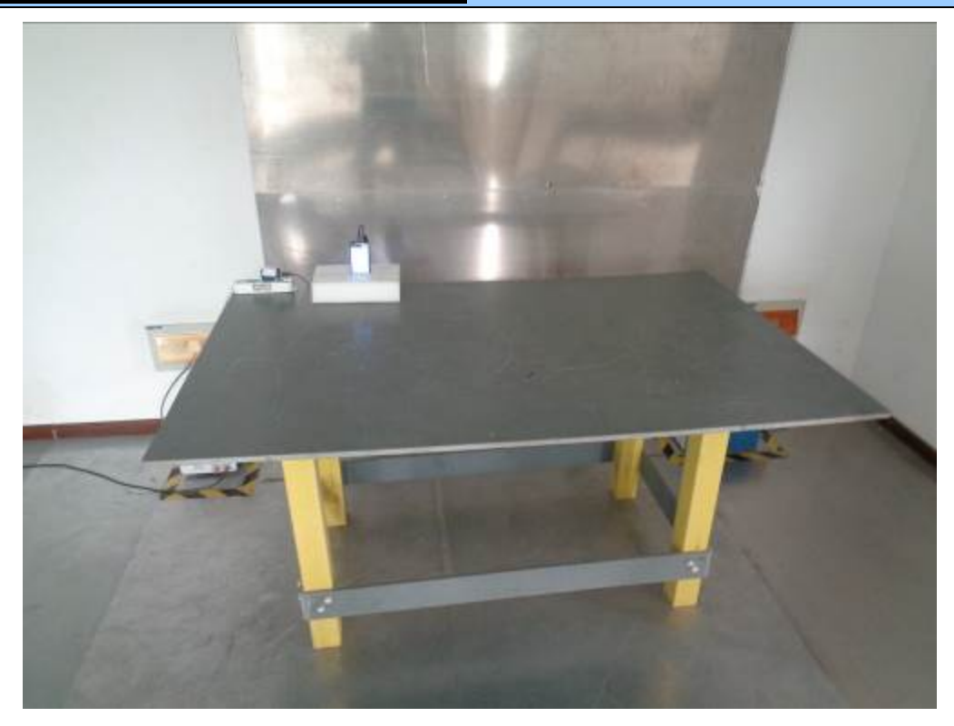
Conducted Emissions Test Setup – Front View