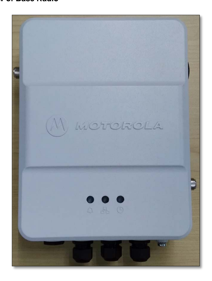
Exhibit 3A - Front View of Base Radio