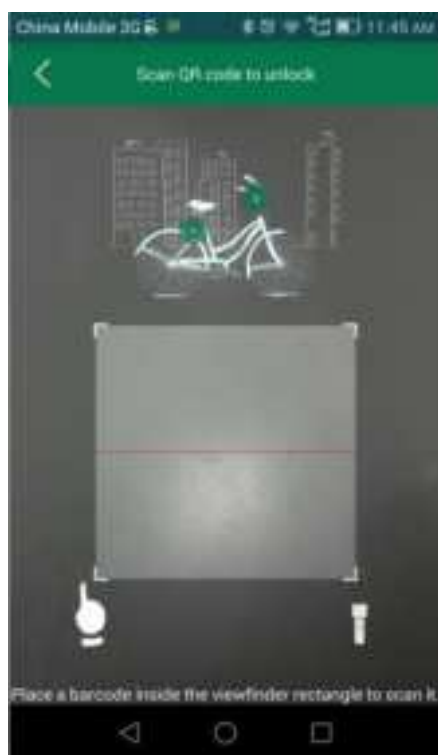
scanning QR code page