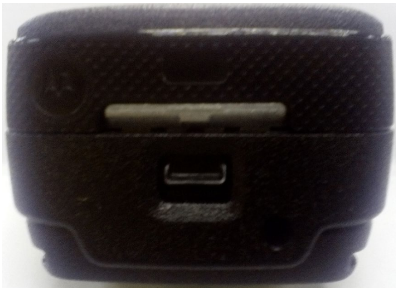
Bottom View with Battery for Limited Keypad and Plain Model – XPR 3500e & XPR 3300e