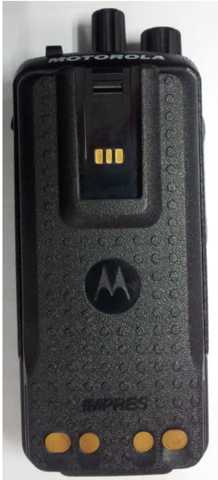
Back View with battery for Limited Keypad and Plain Model (XPR 3500e & XPR 3300e)