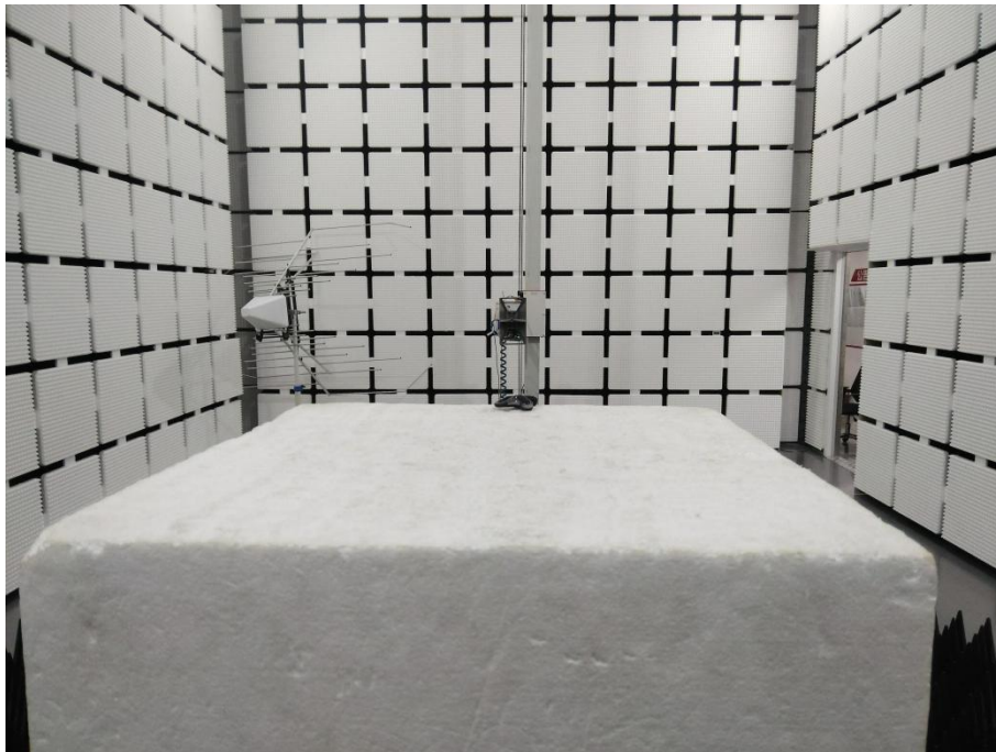
Radiated Spurious Emission (below 1GHz)