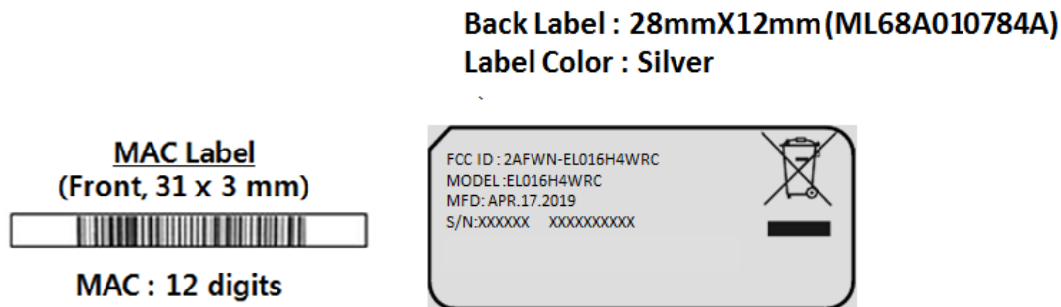
Figure 13.Product and MAC Labels

Product information is indicated on the sticker label of the S-Labels.The information is consisted of MODEL (model name), MFD (manufacturing date), S/N (serial number), MAC (MAC address), CE certification mark, FCC ID and Manufacturer (SoluM).