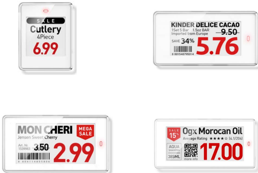
Figure 2.NEWTON S-Label