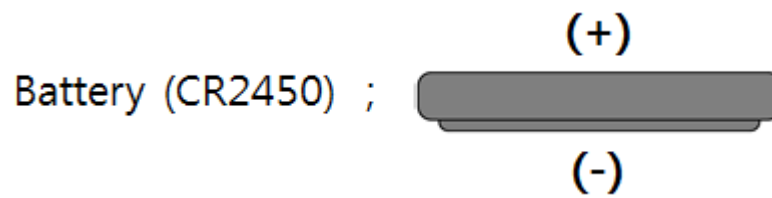
Figure 15. Battery Directional