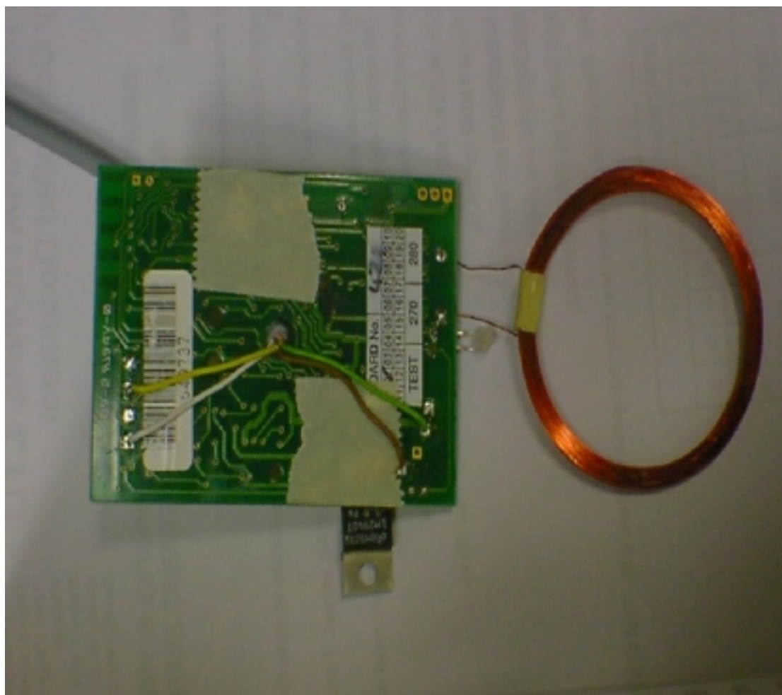
PCB Assembly (Solder side)