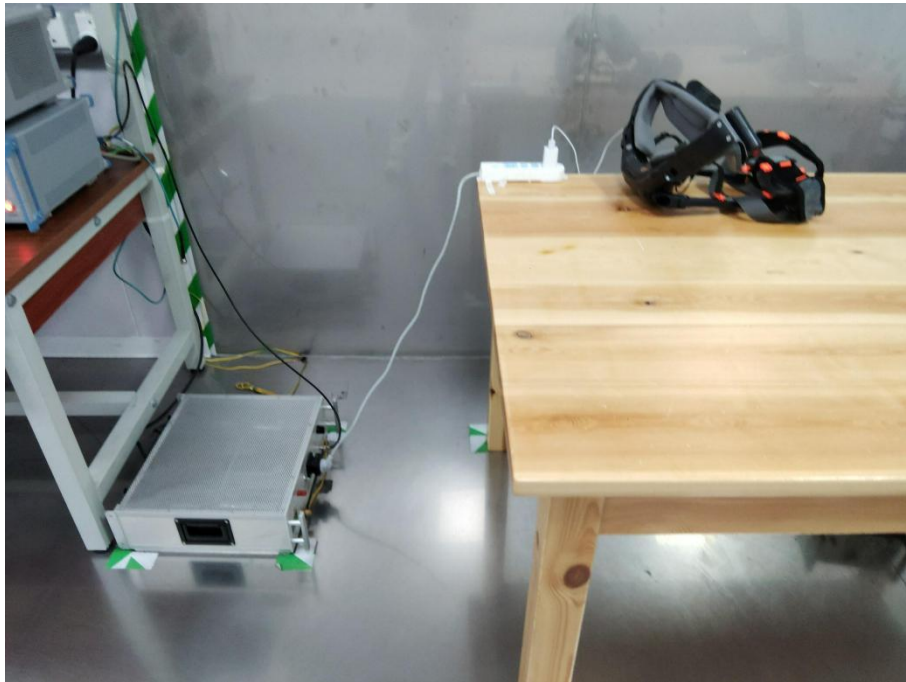
Radiated band edge emission Radiated Spurious Emission (Above 1GHz)