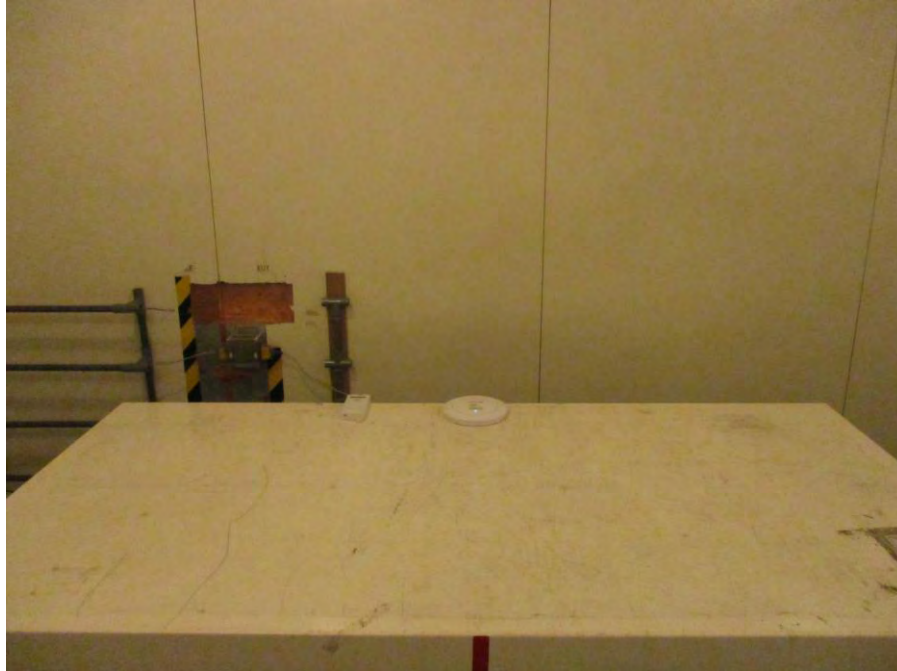
Rear View _ PoE Adapter : ZZU1588-040480