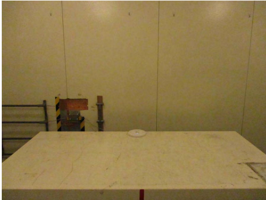
Rear View _ AC Adapter : WA-12M12R