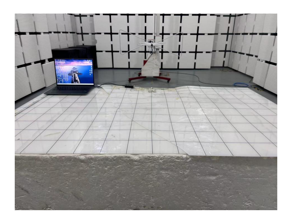
Set-up for Radiated Spurious Emission, Above 1GHz

Set-up for Radiated Spurious Emission, Below 1GHz