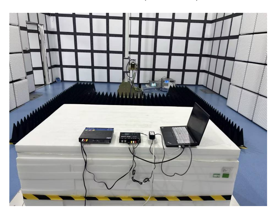
RE - Rear View (Above 1GHz)