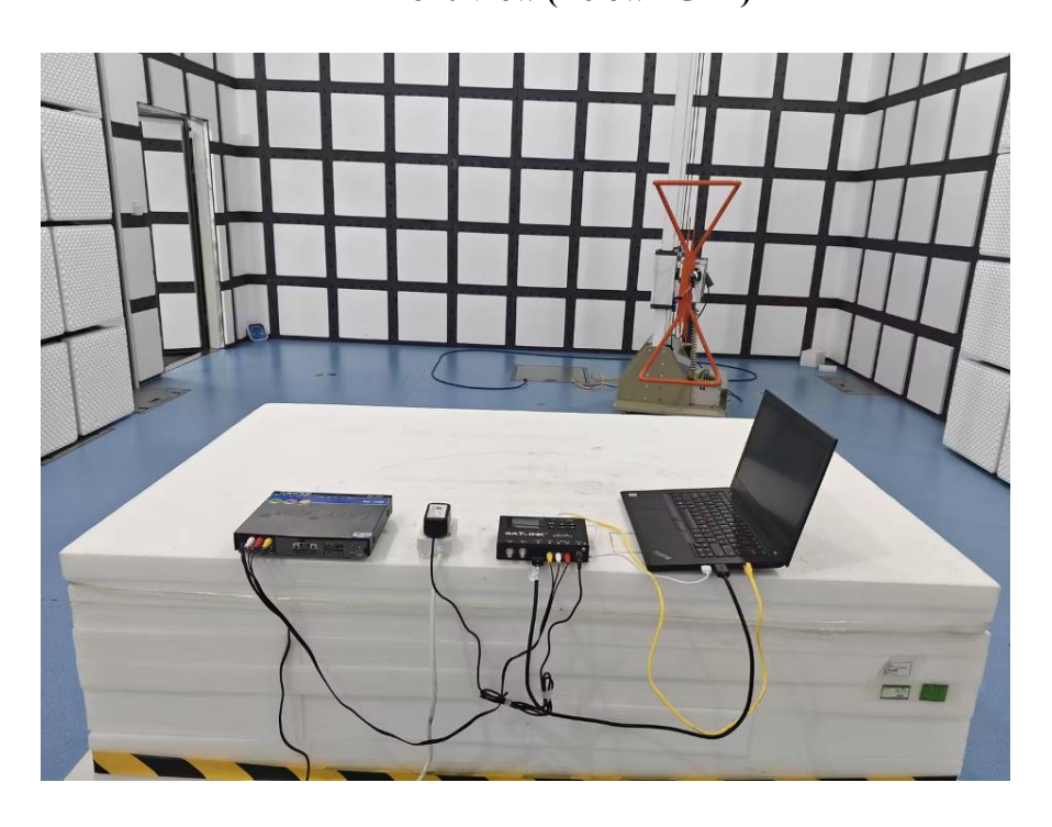
RE - Rear View (Below 1GHz)