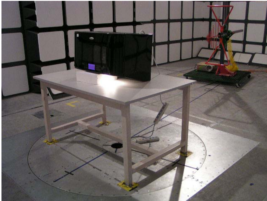
Radiated Emission–Rear View (30MHz to 1000MHz)