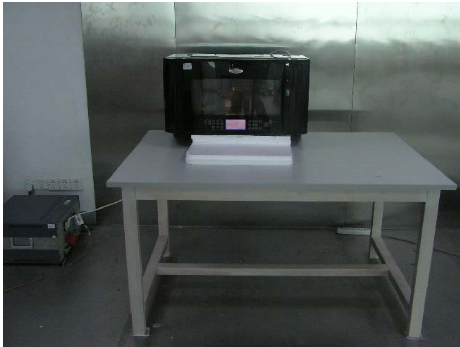
Conducted Emission–Side View