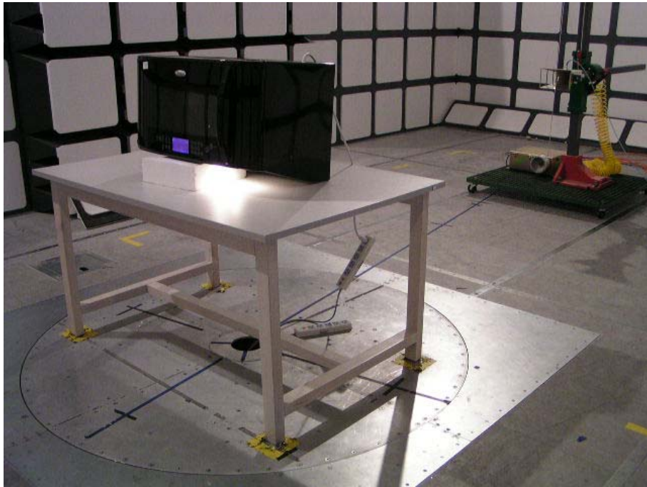
Radiated Emission–Rear View (Above 1 GHz)