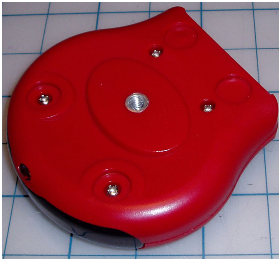
Fig 3 – Underside of RF Host