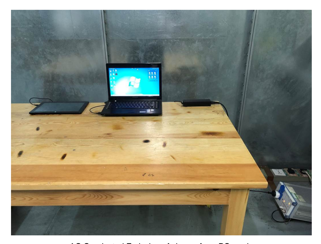
AC Conducted Emission of charge from PC mode