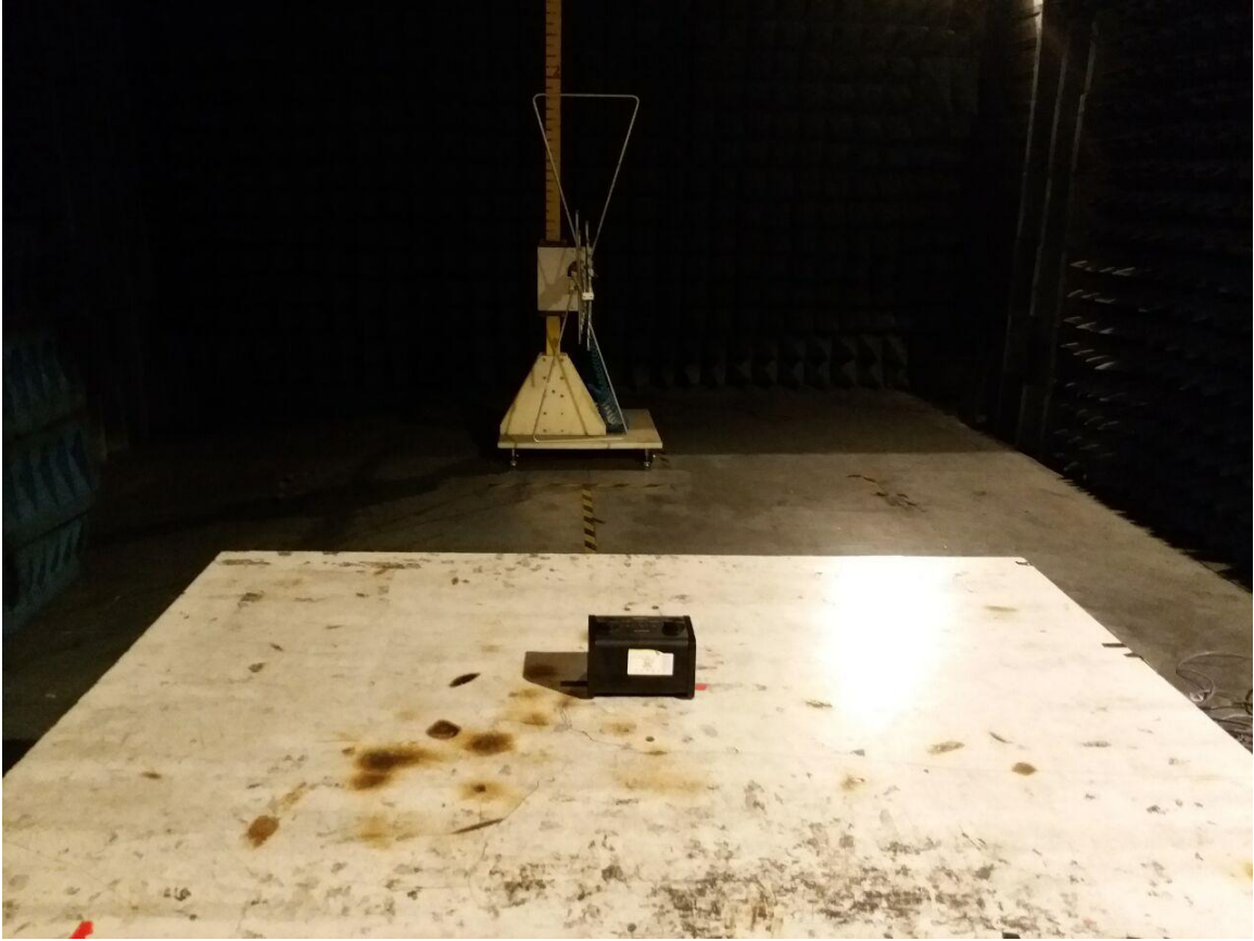
Conducted Measurement Photos