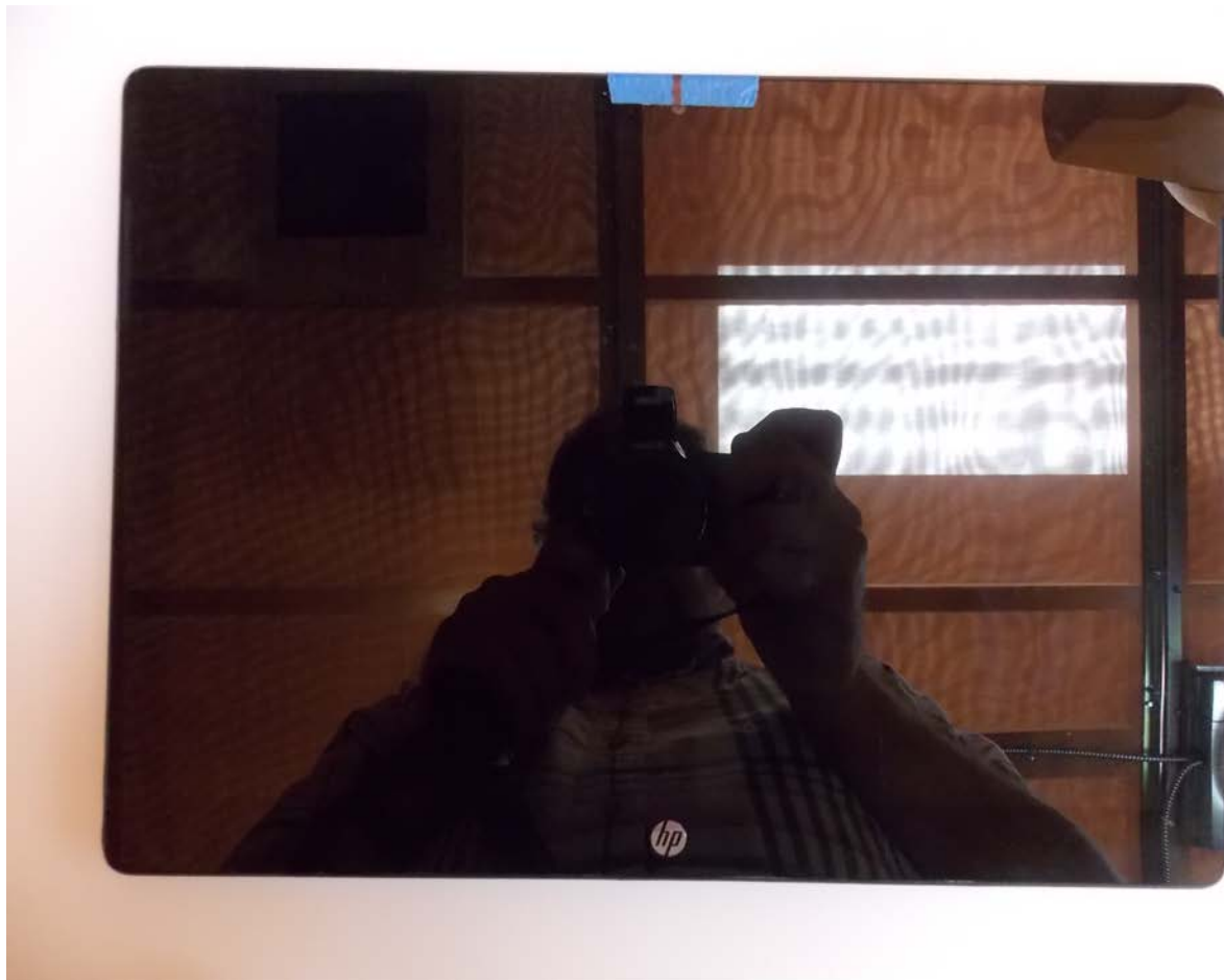
Front of Device Tablet Mode