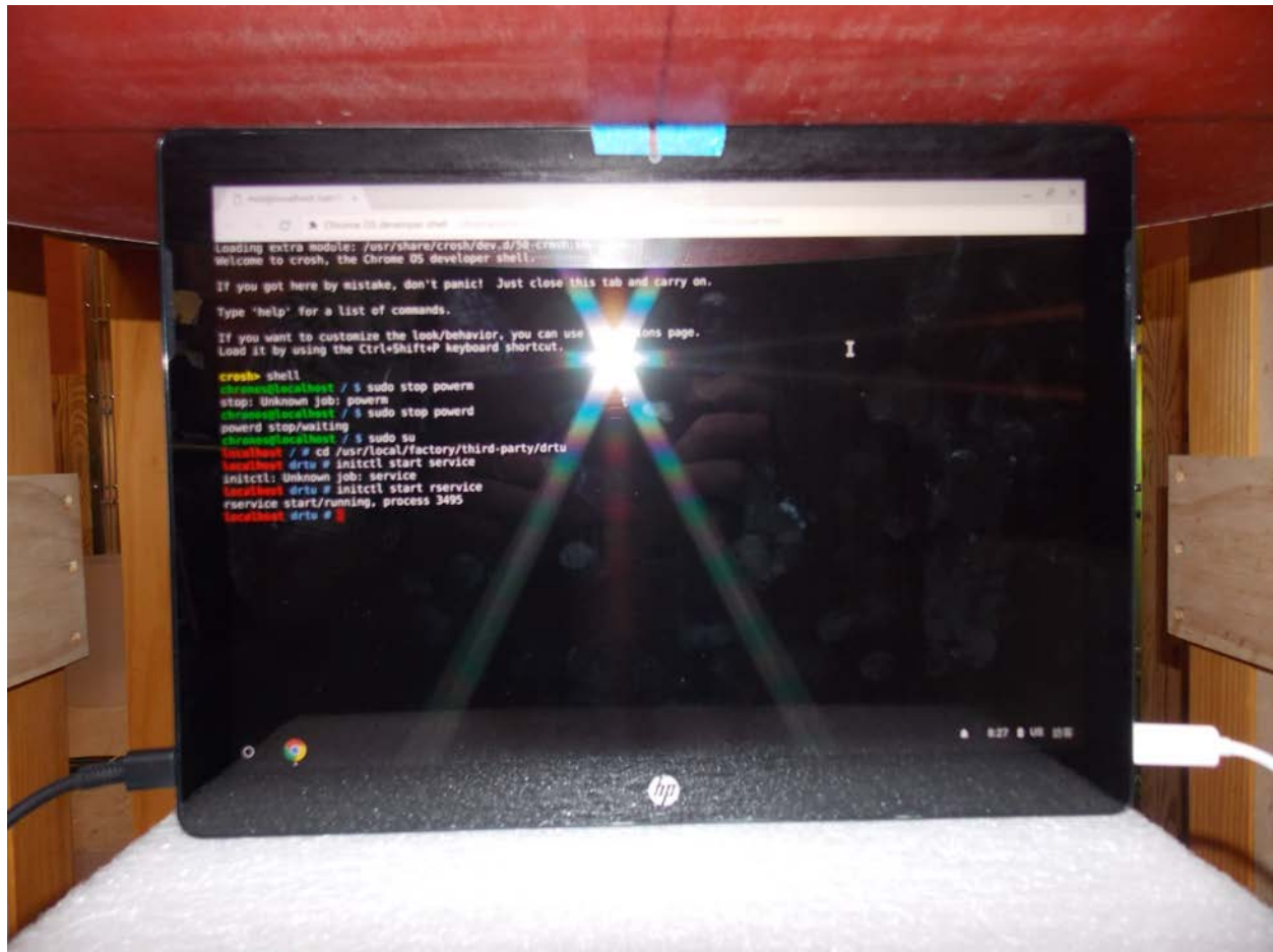
Test Position Top 0 mm Gap