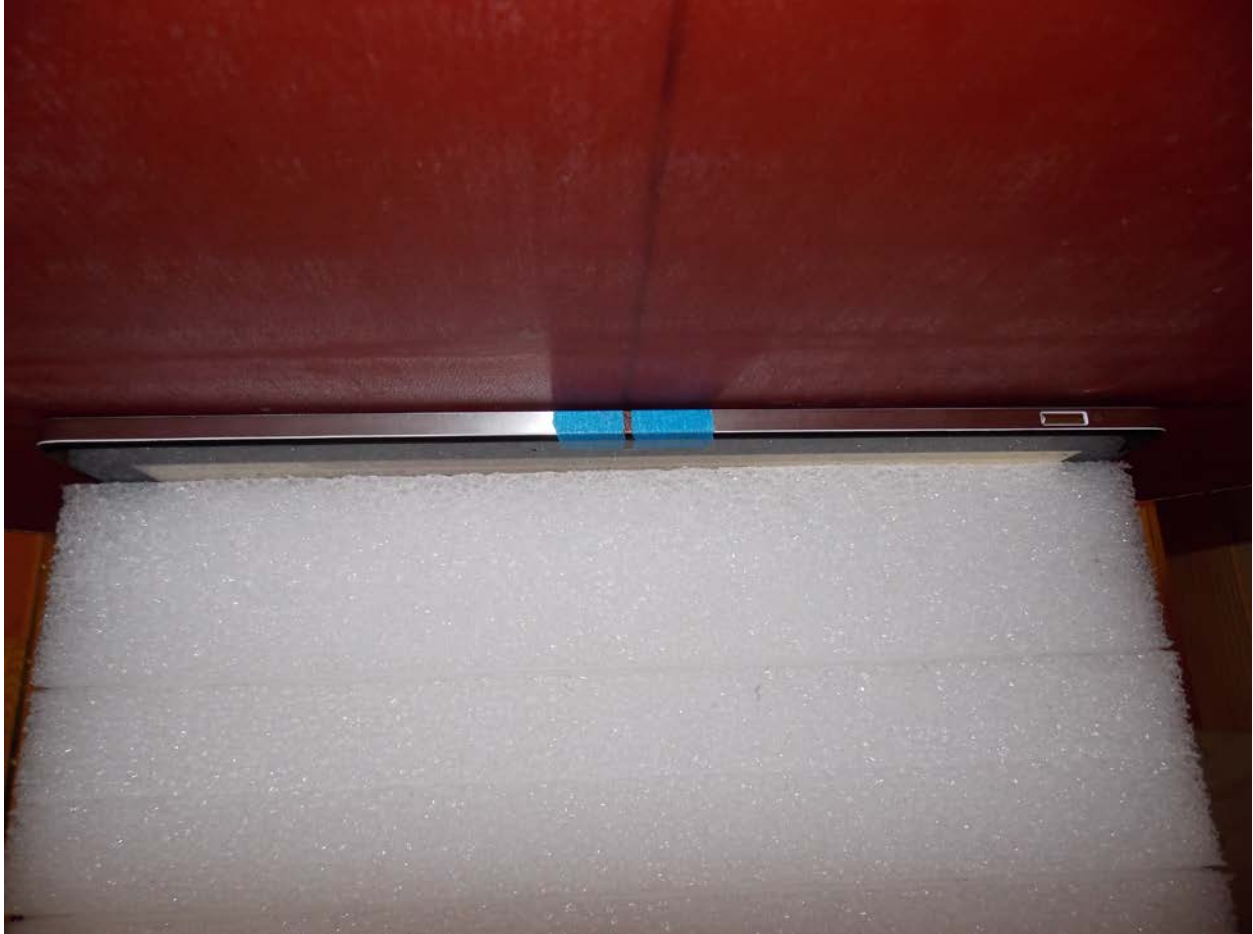
Test Position Back 0 mm Gap