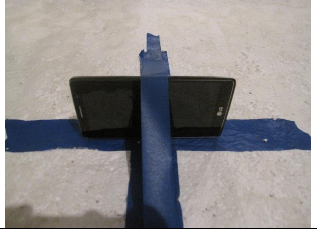
Z-AXIS FRONT PHOTO