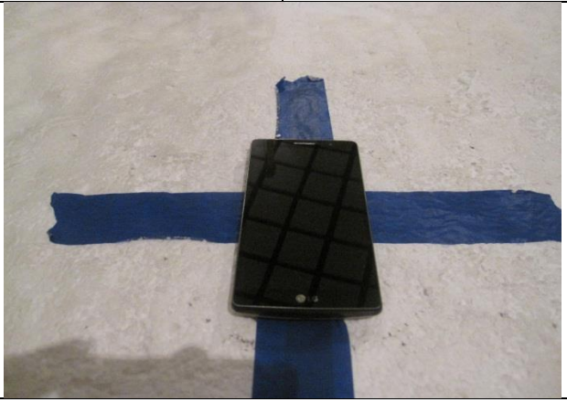
X-AXIS FRONT PHOTO