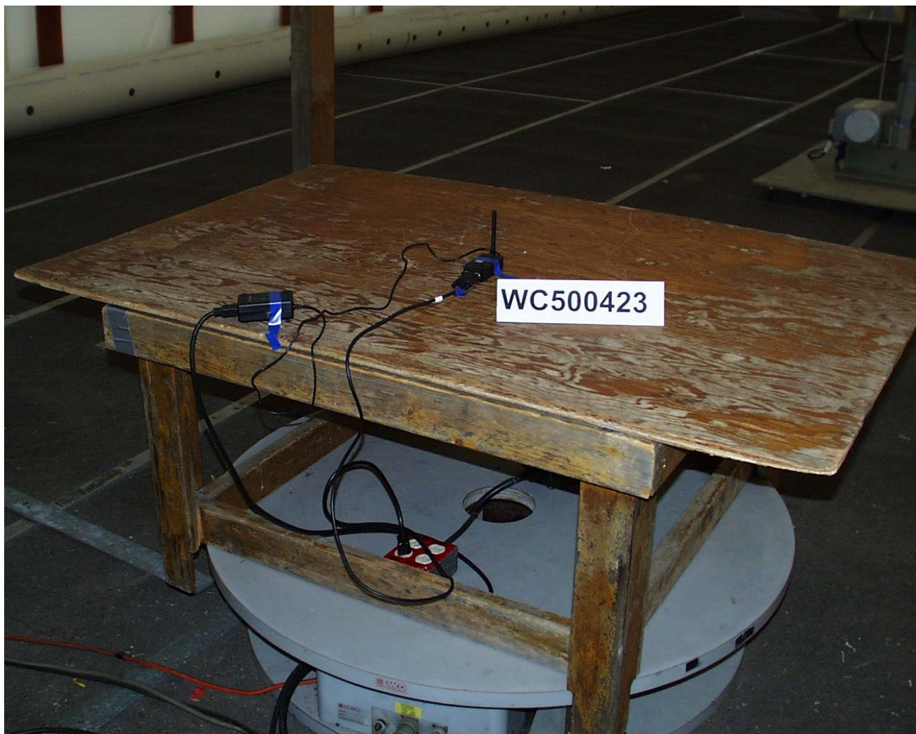
Test-setup photo: Radiated emission 30 MHz - 25000 MHz