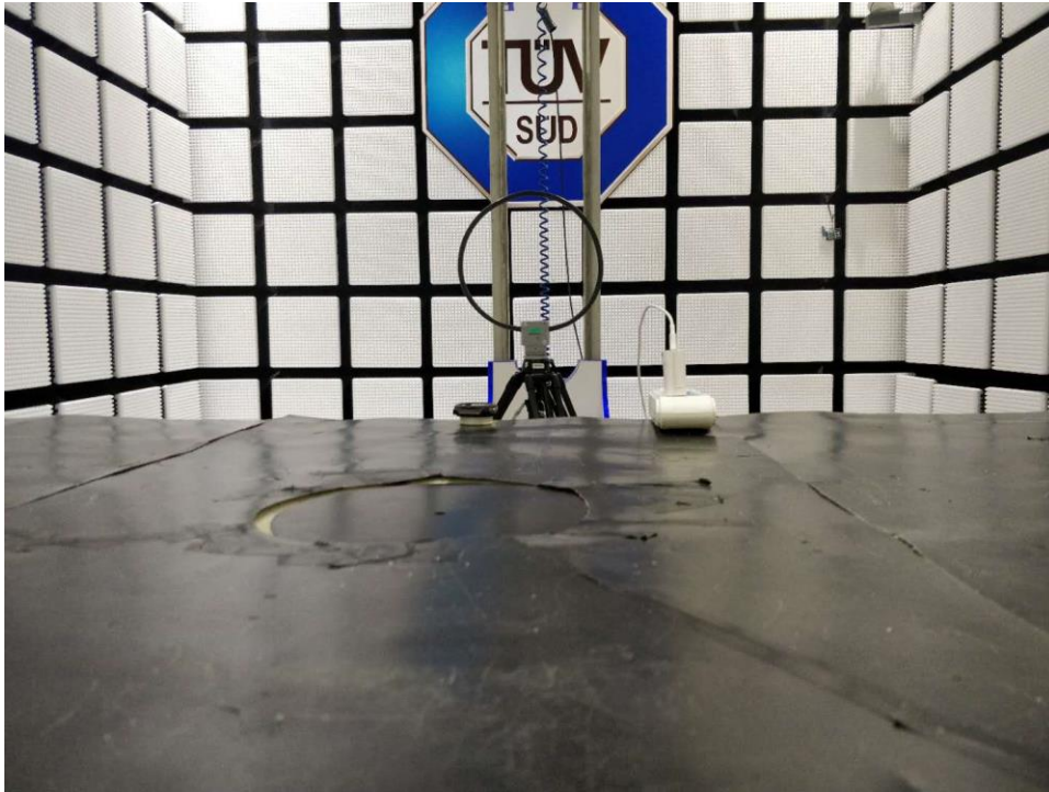
radiated spurious emission 9KHz-30MHz