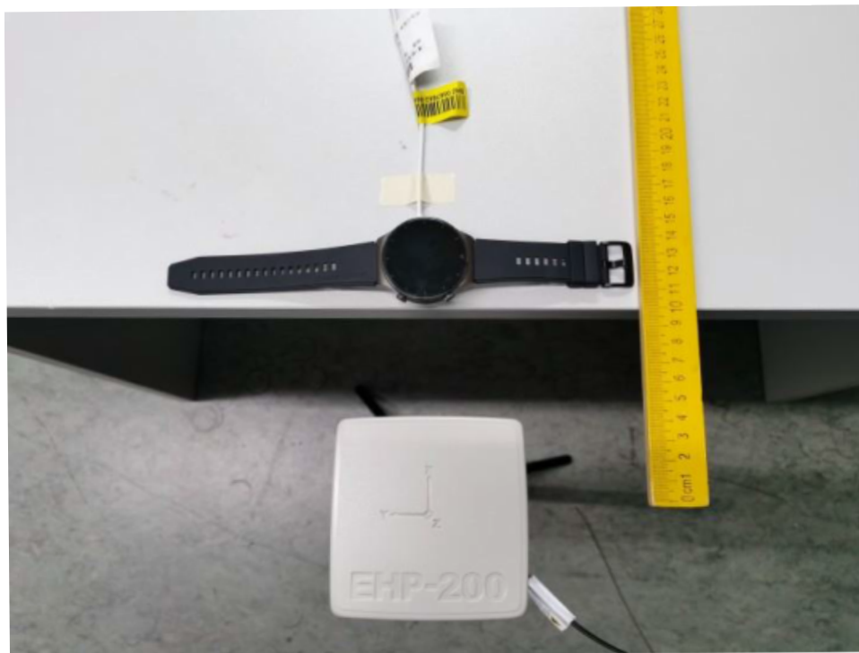
RF exposure test