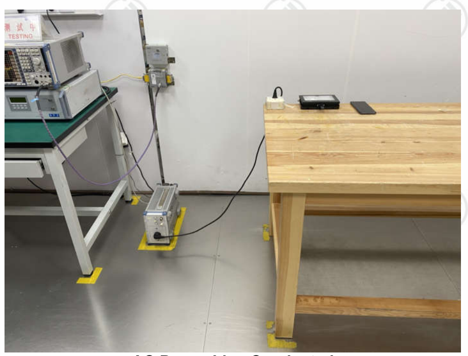
AC Power Line Conducted Emission Test Setup