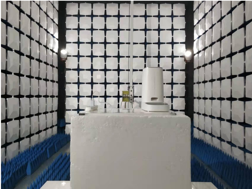
Below 1GHz for radiated emission test setup