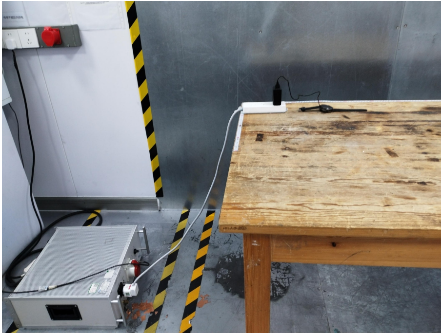
Emissions in frequency bands (below 1GHz)