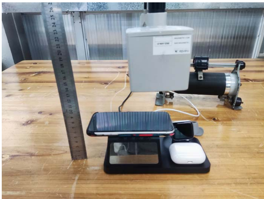
Test Position F-20cm from the edge of EUT to the geometric center of the probe