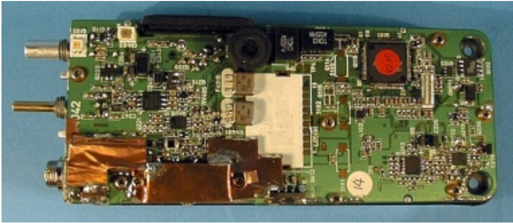
Main Board Bottom, w/Shields