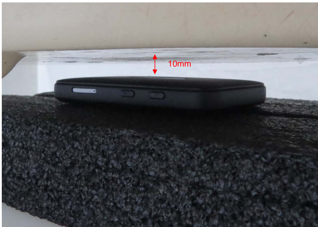
Picture 2: Front Side, the distance from handset to the bottom of the Phantom is 10mm