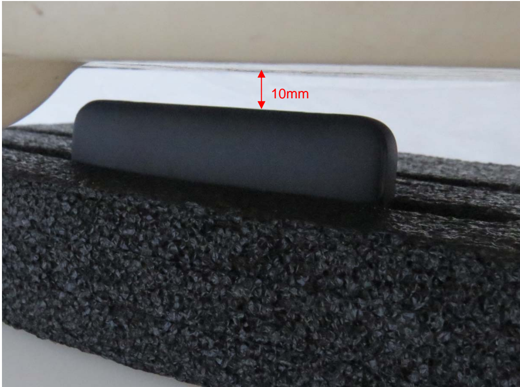
Picture 5: Top Side, the distance from handset to the bottom of the Phantom is 10mm