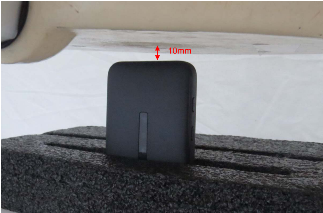
Picture 3: Left Side, the distance from handset to the bottom of the Phantom is 10mm