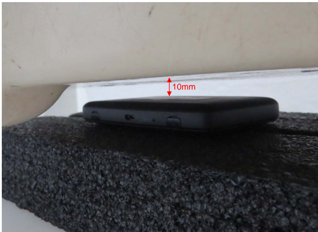
Picture 1: Back Side, the distance from handset to the bottom of the Phantom is 10mm