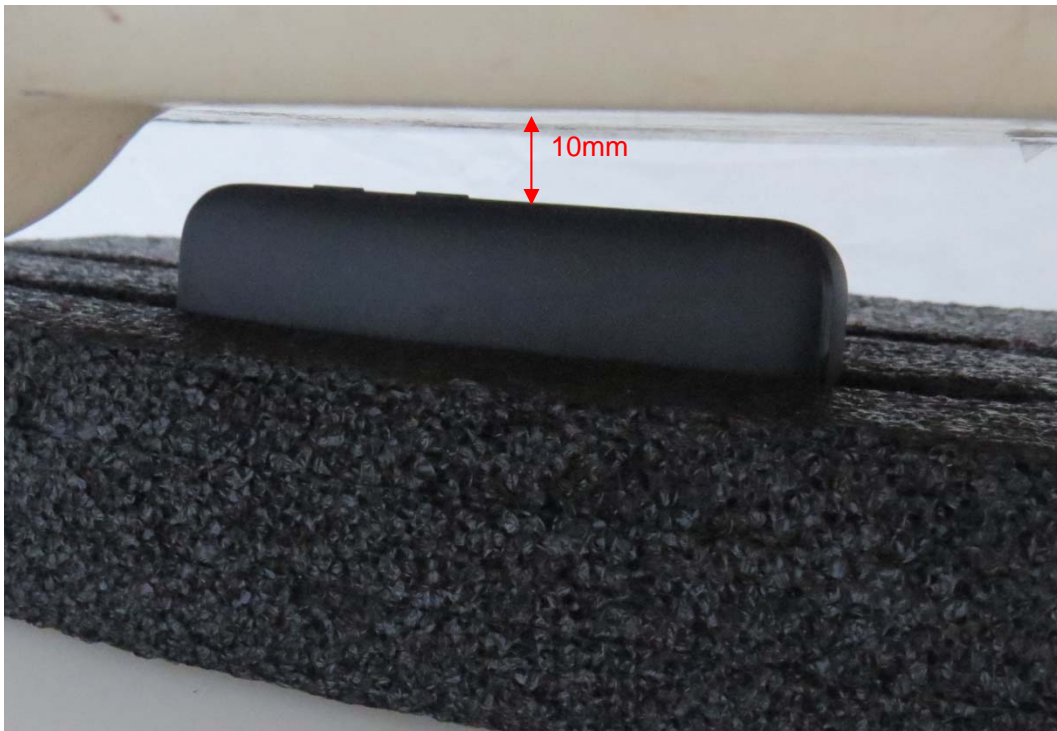
Picture 6: Bottom Edge, the distance from handset to the bottom of the Phantom is 10mm