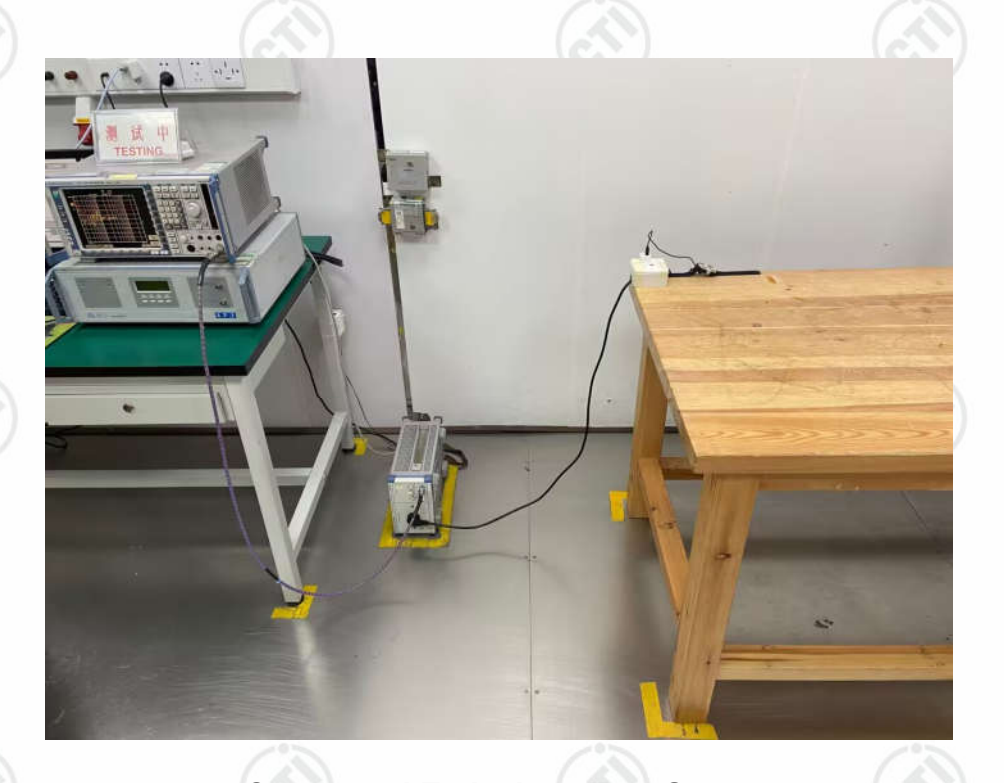
Conducted Emissions Test Setup