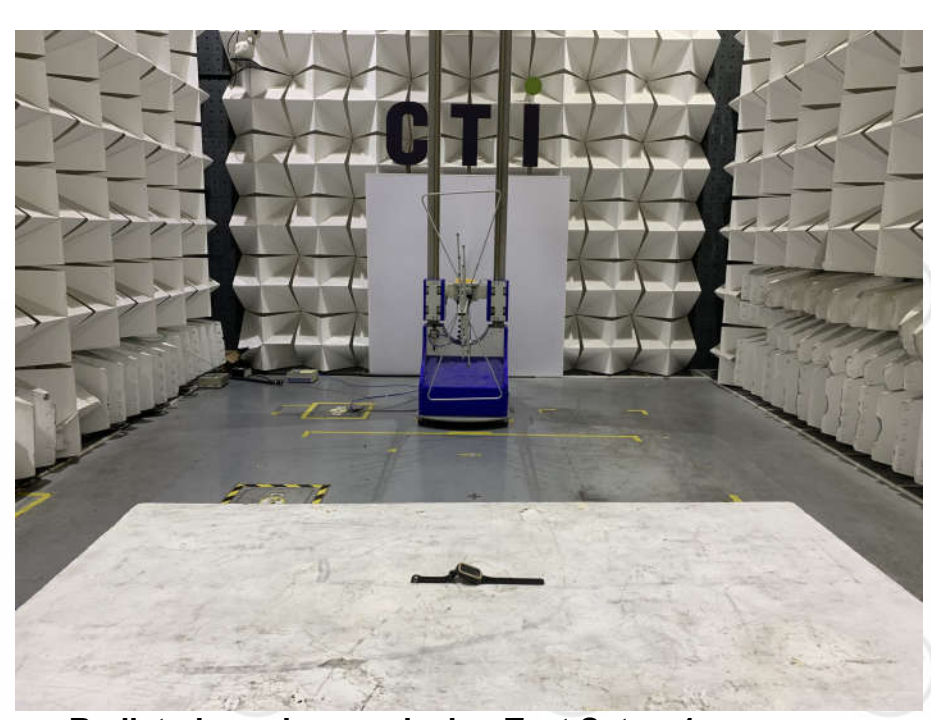
Radiated spurious emission Test Setup-1(Below 1GHz)