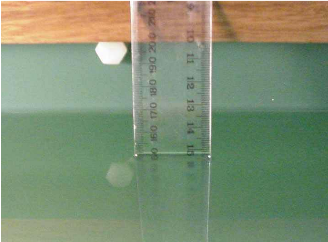
Photo of liquid Depth in Flat Phantom

During the SAR measurement process the liquid level was maintained to a level of a least 15cm with a tolerance of 0.5cm.