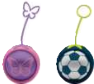
Series: IJ305A, IJ306A FCC ID : 2AJXA-BTSPK-3