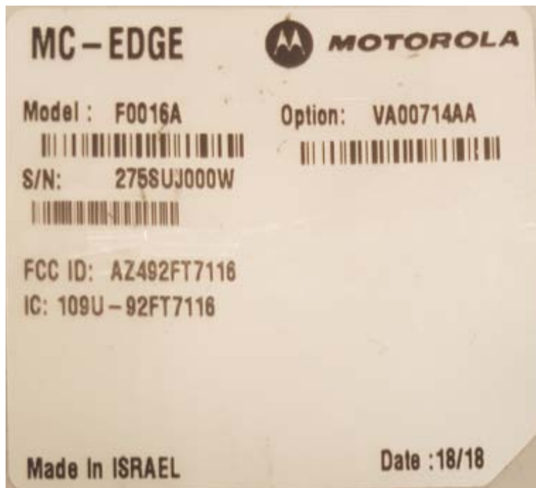
EXHIBIT 1A – FCC/IC Label for APX4000 900 for MC-EDGE