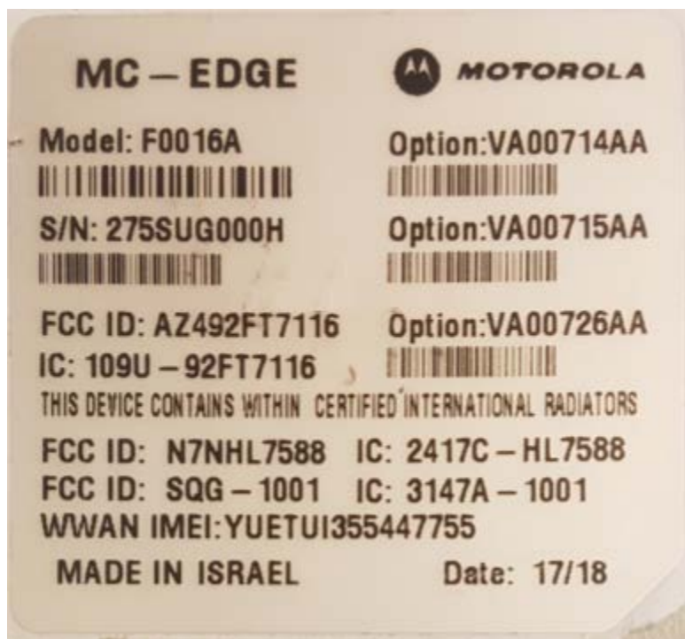
EXHIBIT 1D – FCC/IC Label for APX4000 900 for MC-EDGE with LTE and LoRA Options