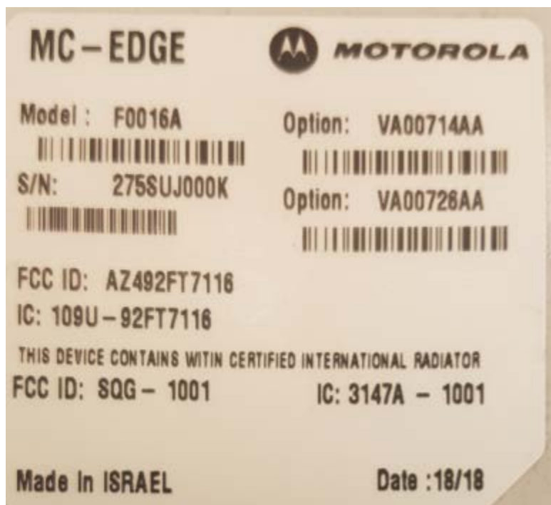
EXHIBIT 1C – FCC/IC Label for APX4000 900 For MC-EDGE with LoRA Options