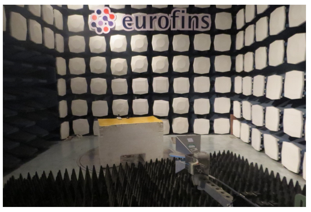
1GHz-18GHz Picture 1: Radiated Emission Test Setup