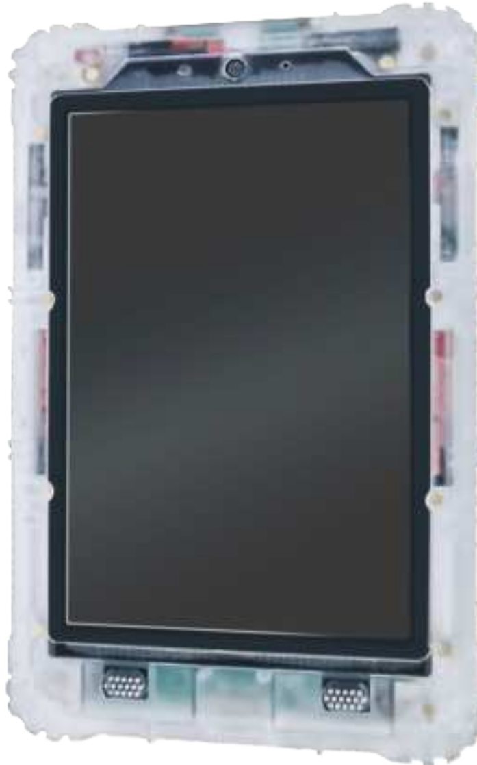
Figure 2-1 Top view

Figure 2-1 and Figure 2-2 show the views of our product.