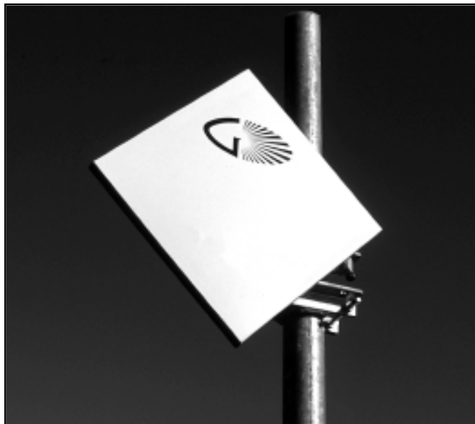
5 GHz Directional Flat Panel Antenna