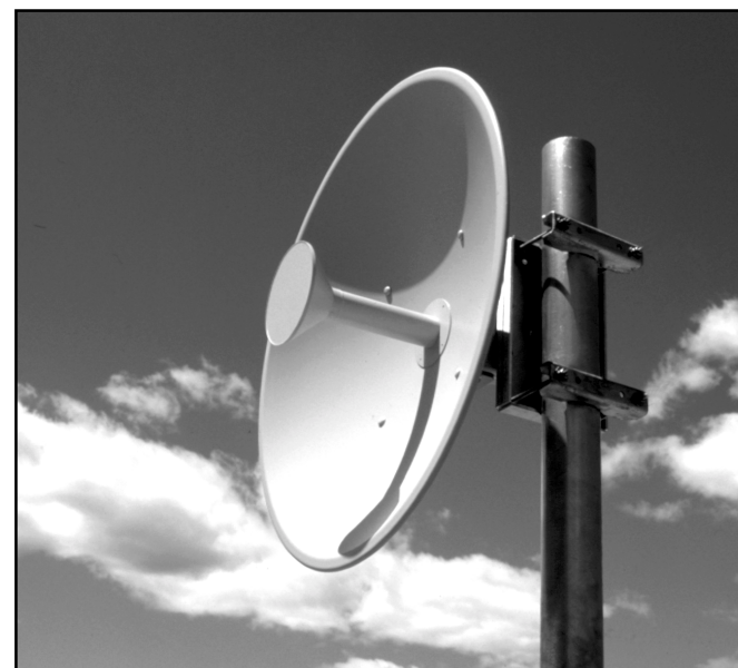
Gabriel "UNII" and "ISM" Band 2-ft. (0.6 m) - Plane Polarized - Standard Parabolic Antenna

See the Special Application section of this catalog for Gabriel's Directional Flat Panel antennas for Spread Spectrum operation.