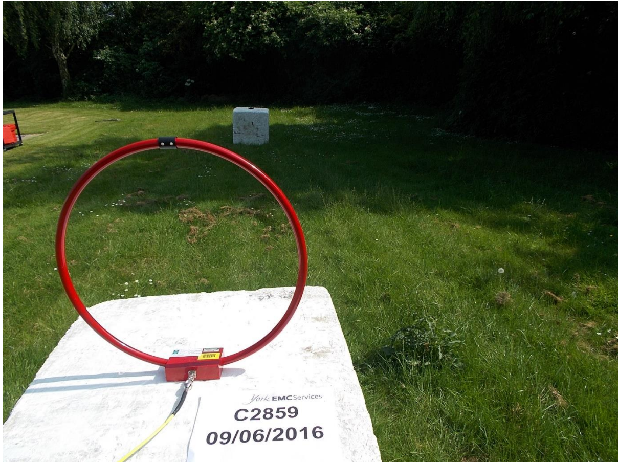
Photograph 2 Radiated Magnetic Field Final Measurements 9kHz to 30MHz