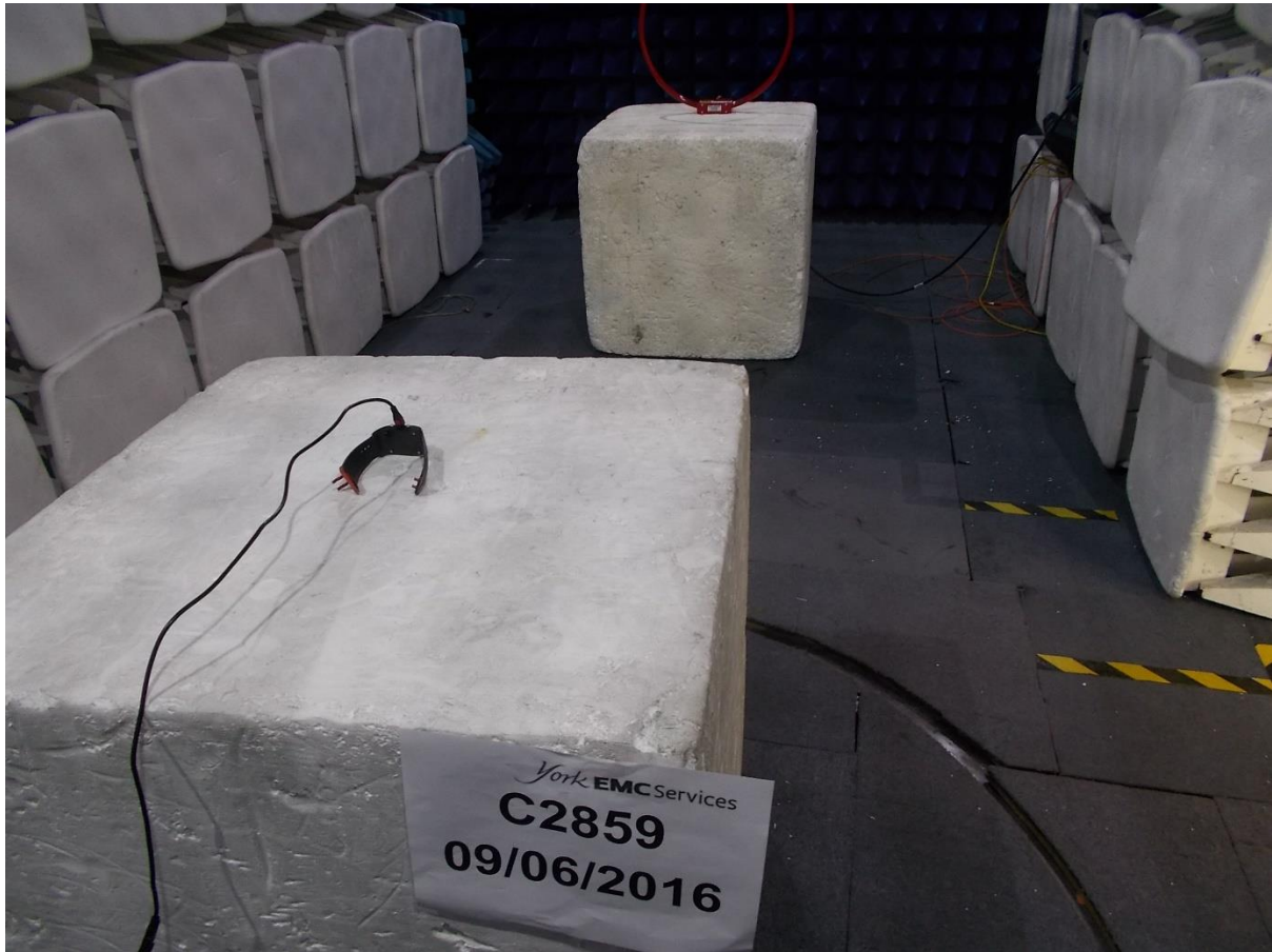
Photograph 1 Radiated Magnetic Field Preliminary Measurements 9kHz to 30MHz