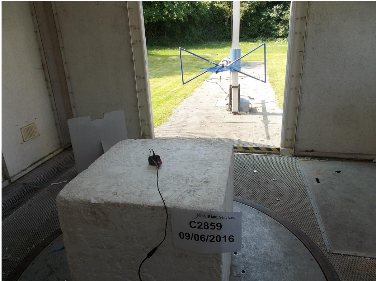
Photograph 4 Radiated Electric Field Final Measurements 30MHz to 1GHz