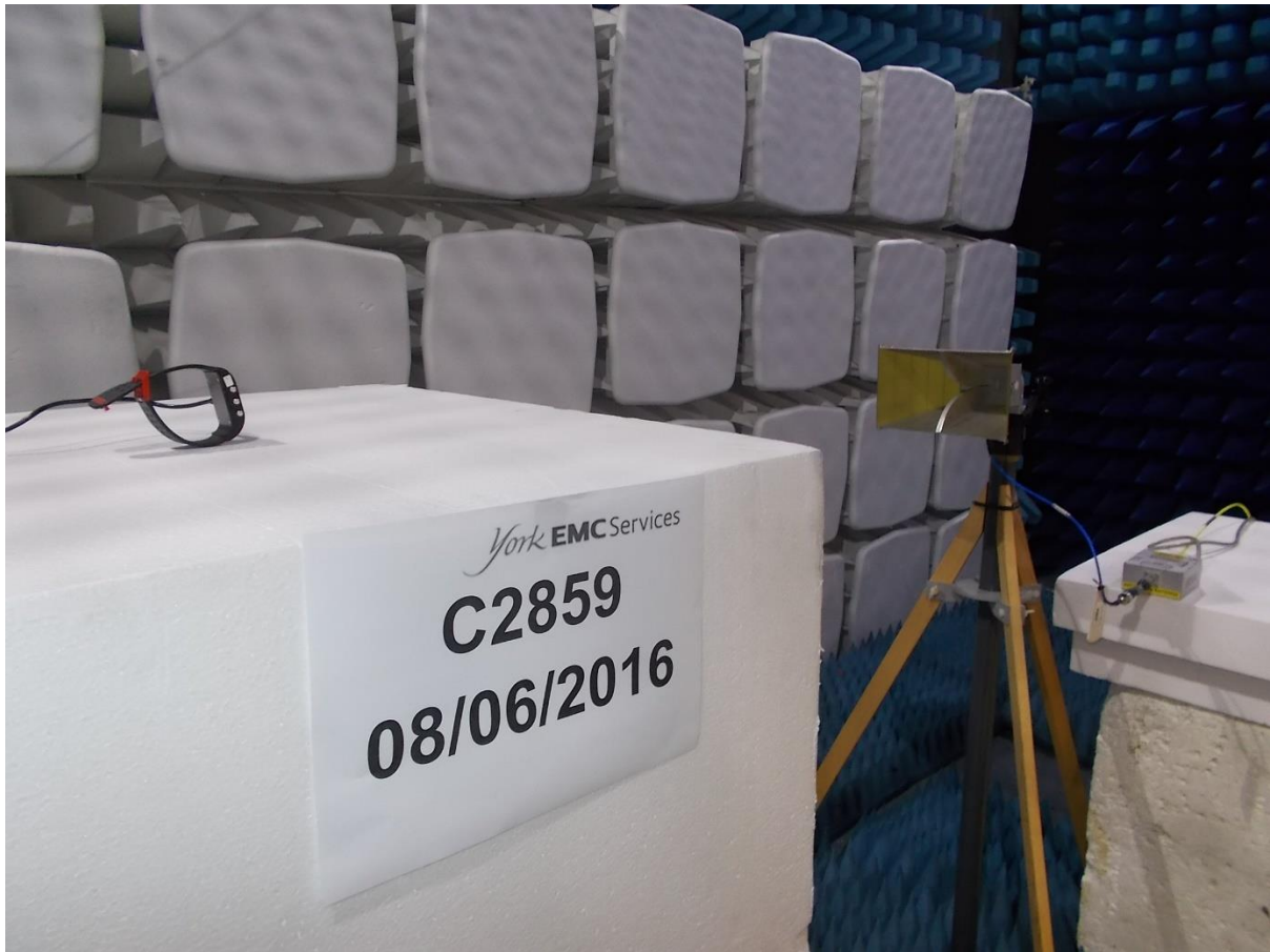
Photograph 5 Radiated Electric Field Measurements GHz to 18GHz and Band Edge compliance set up