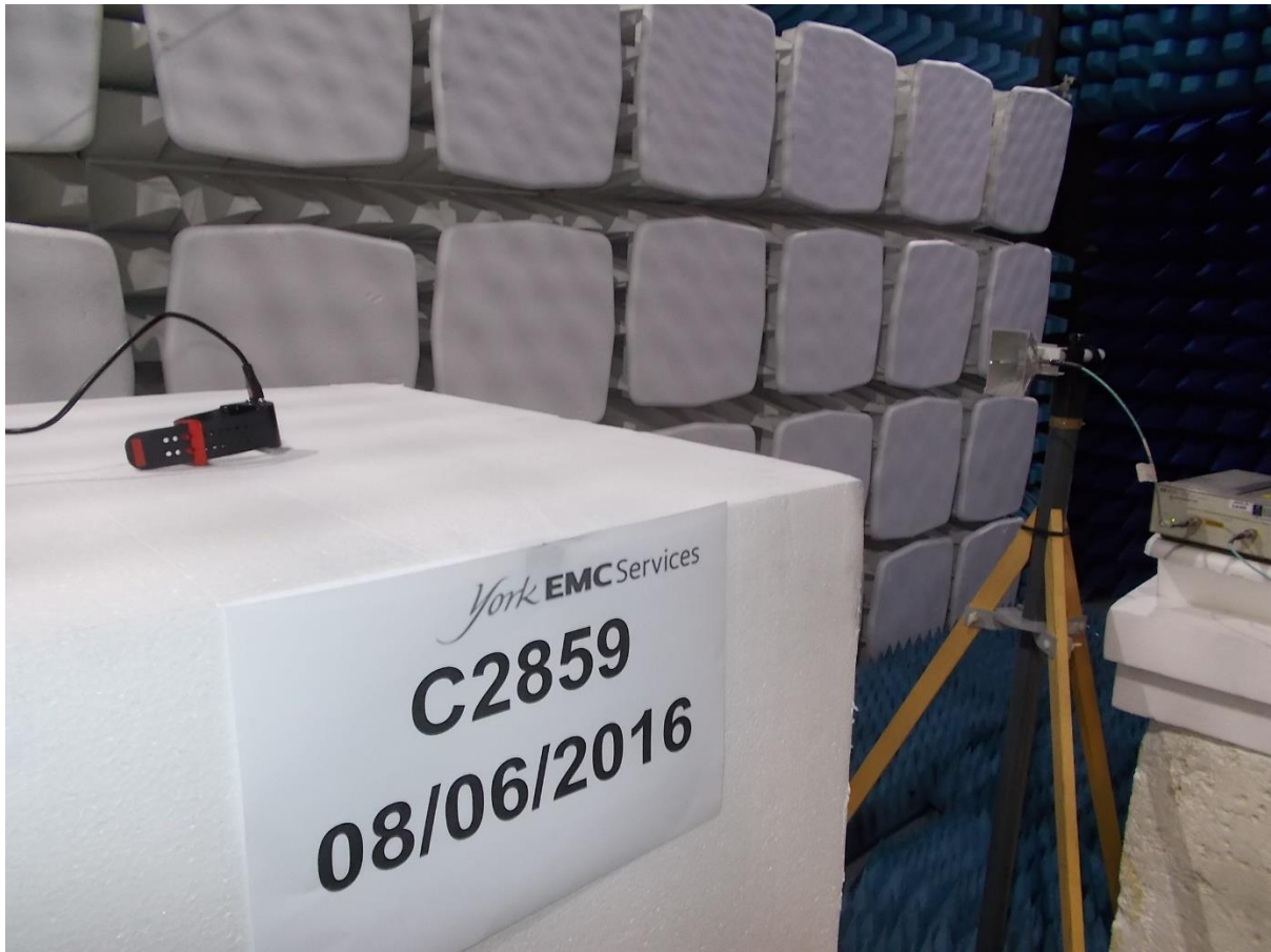
Photograph 6 Radiated Electric Field Measurements 18GHz to 26GHz