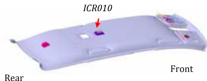
Figure 1. Option 1