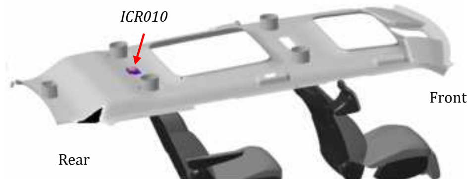
Figure 2. Option 2

If the ICR010 is installed such that it is not visible (e.g., behind the headliner), then the ICR010 integrator must include the below interference statement in accordance with the provisions of 47 CFR §§ 2.925 and 15.19 in the vehicle's Owner's Manual.