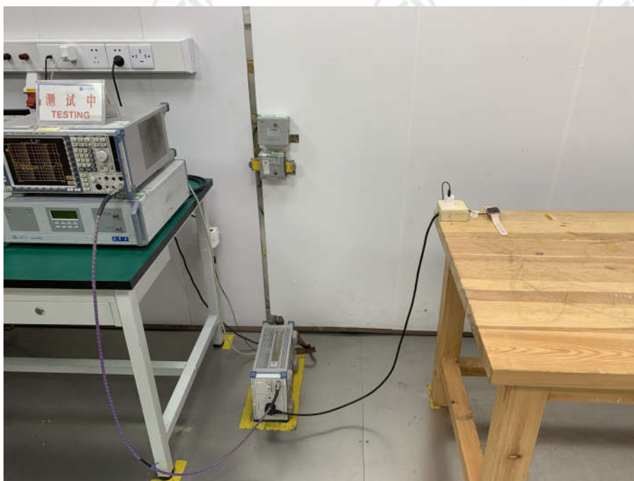
AC Power Line Conducted Emission