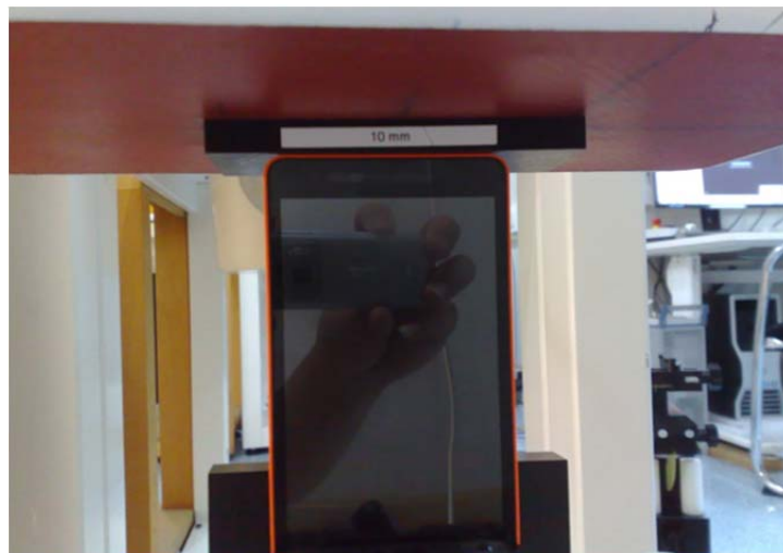
Photo of the device positioned for WR mode measurement – bottom edge facing phantom. The spacer was removed before the start of the measurements.