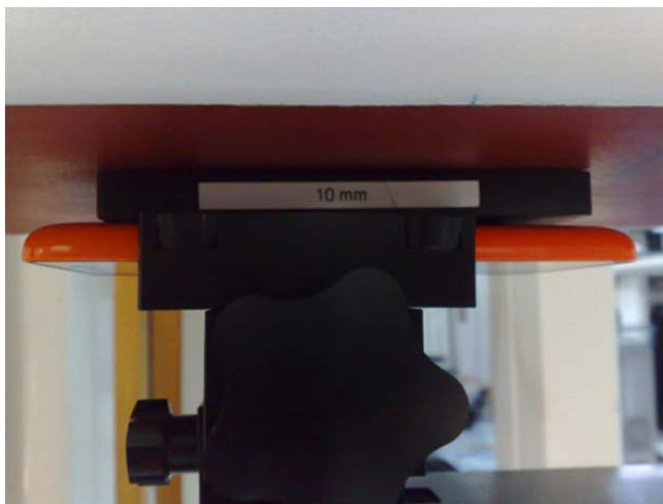
Photo of the device positioned for WR mode measurement –back facing phantom. The spacer was removed before the start of the measurements.

The device was placed in the SPEAG holder and, in sequence, the back, display and each of the 4 edges was positioned 10.0mm away from the flat phantom. The spacer was removed before the start of the measurements.