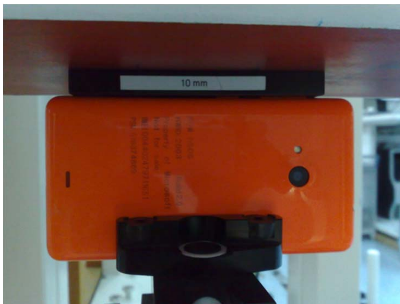
Photo of the device positioned for WR mode measurement – right edge facing phantom. The spacer was removed before the start of the measurements