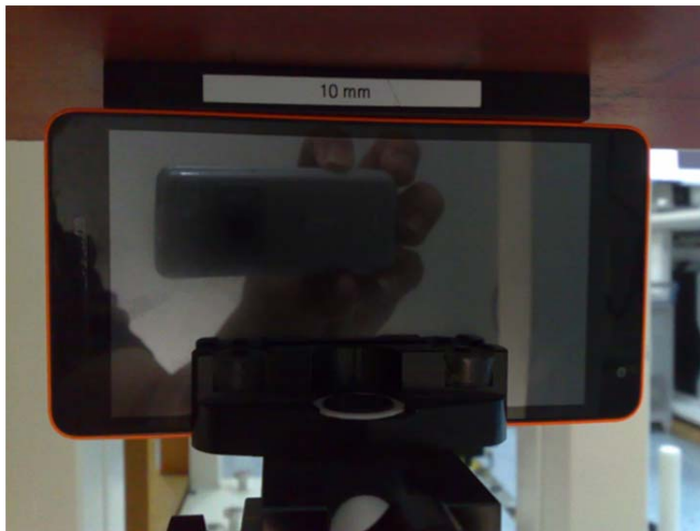
Photo of the device positioned for WR mode measurement – left edge facing phantom. The spacer was removed before the start of the measurements.