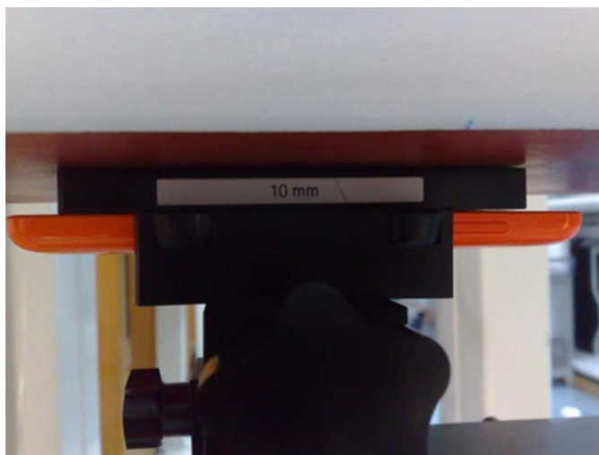
Photo of the device positioned for WR mode measurement – display facing phantom. The spacer was removed before the start of the measurements.