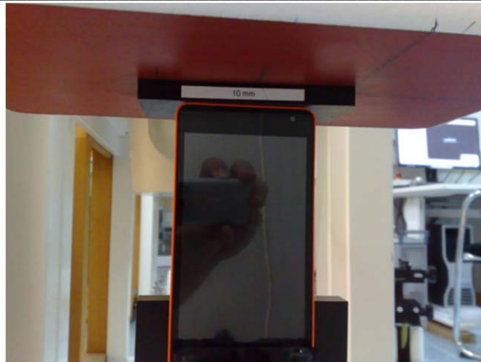
Photo of the device positioned for WR mode measurement – top edge facing phantom. The spacer was removed before the start of the measurements.