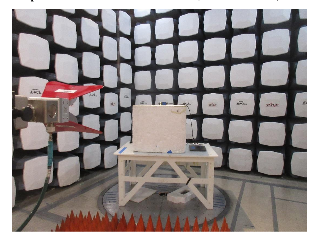
1.6 Radiated Spurious Emissions measured at 3 meter, 1 GHz to 18 GHz, Rear View