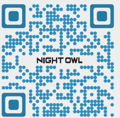
Option 2c Setup Video

NOTE: Our WNIP2 Series Wi-Fi NVR is ONLY compatible with our WNIP2 Series cameras.