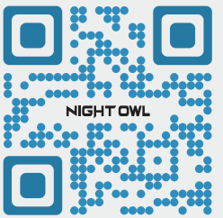
Option 2a Setup Video

NOTE: Our WNIP8 Series cameras cannot be added to our BT D2 Series DVRs.