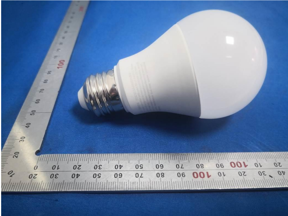
FRONT VIEW OF EUT