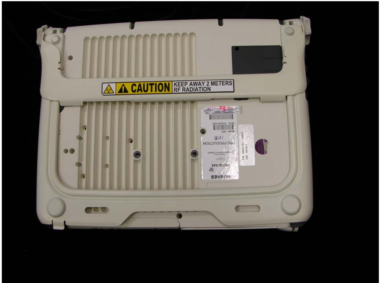
This picture shows the UT with its stand stowed, ready for transportation.