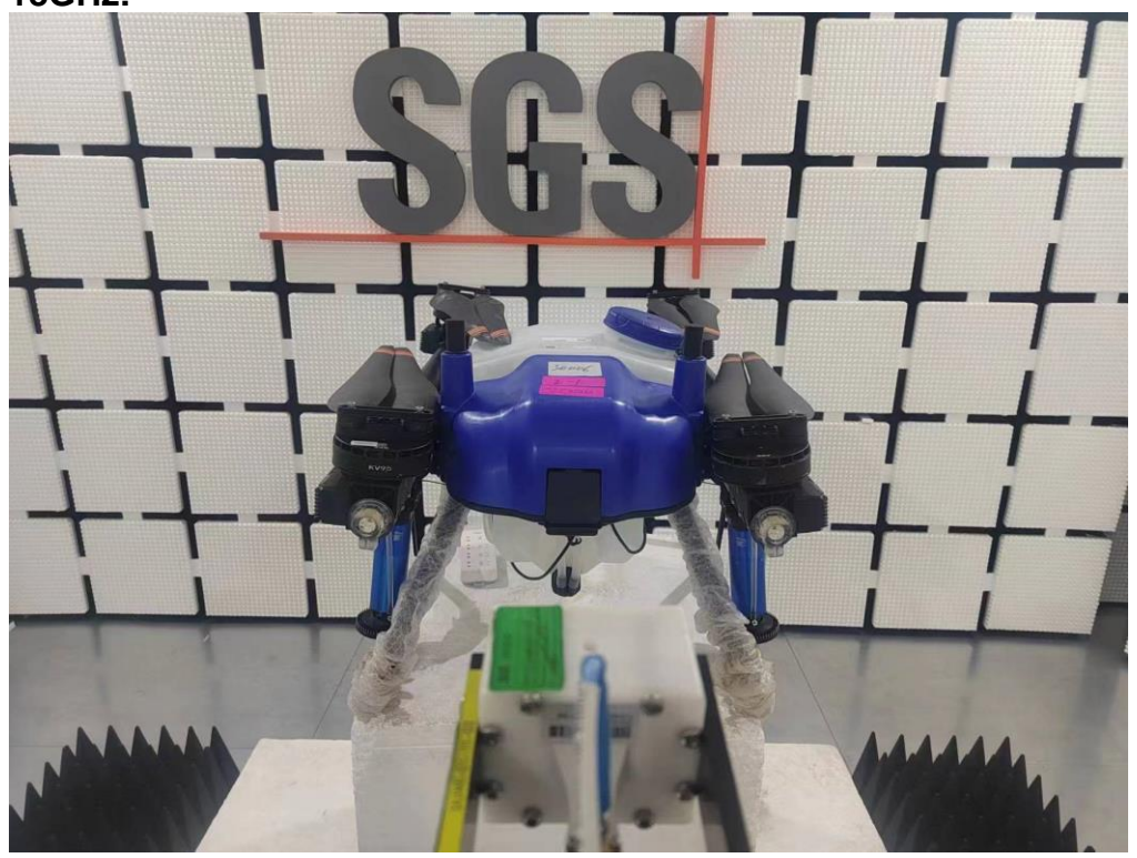
---End of Attachment---