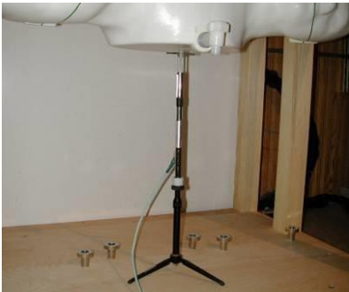
Figure 8-2 System Verification Setup Photo