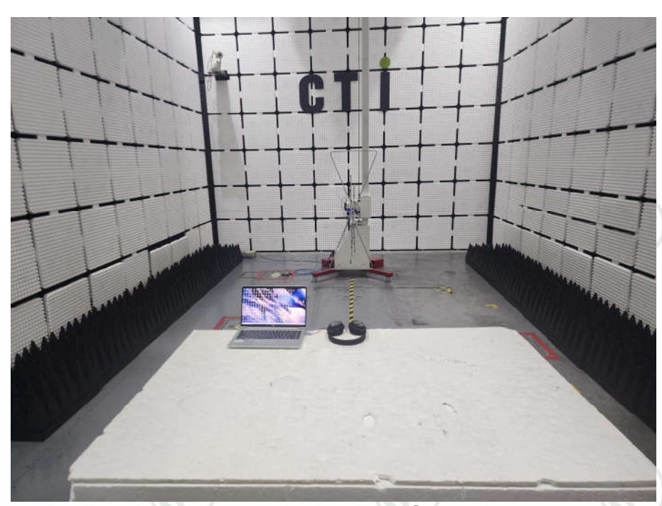
Radiated spurious emission Test Setup-1 (Below 1GHz)