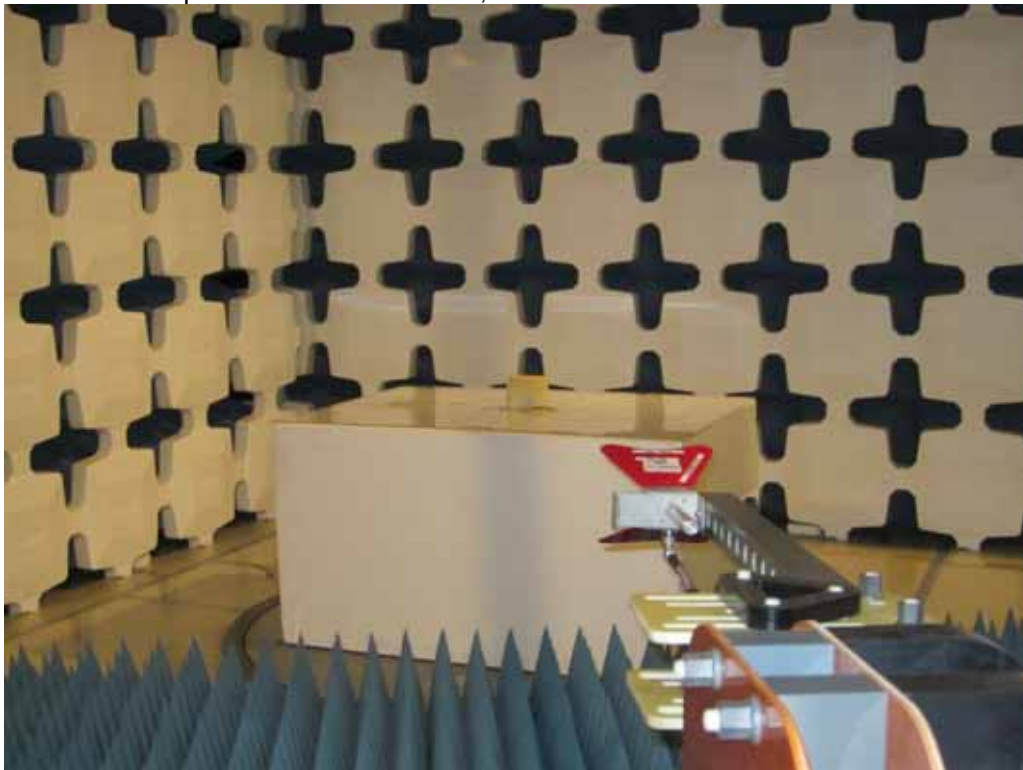
Test Setup for Radiated Emissions, 1GHz to 5GHz – Vertical Polarization