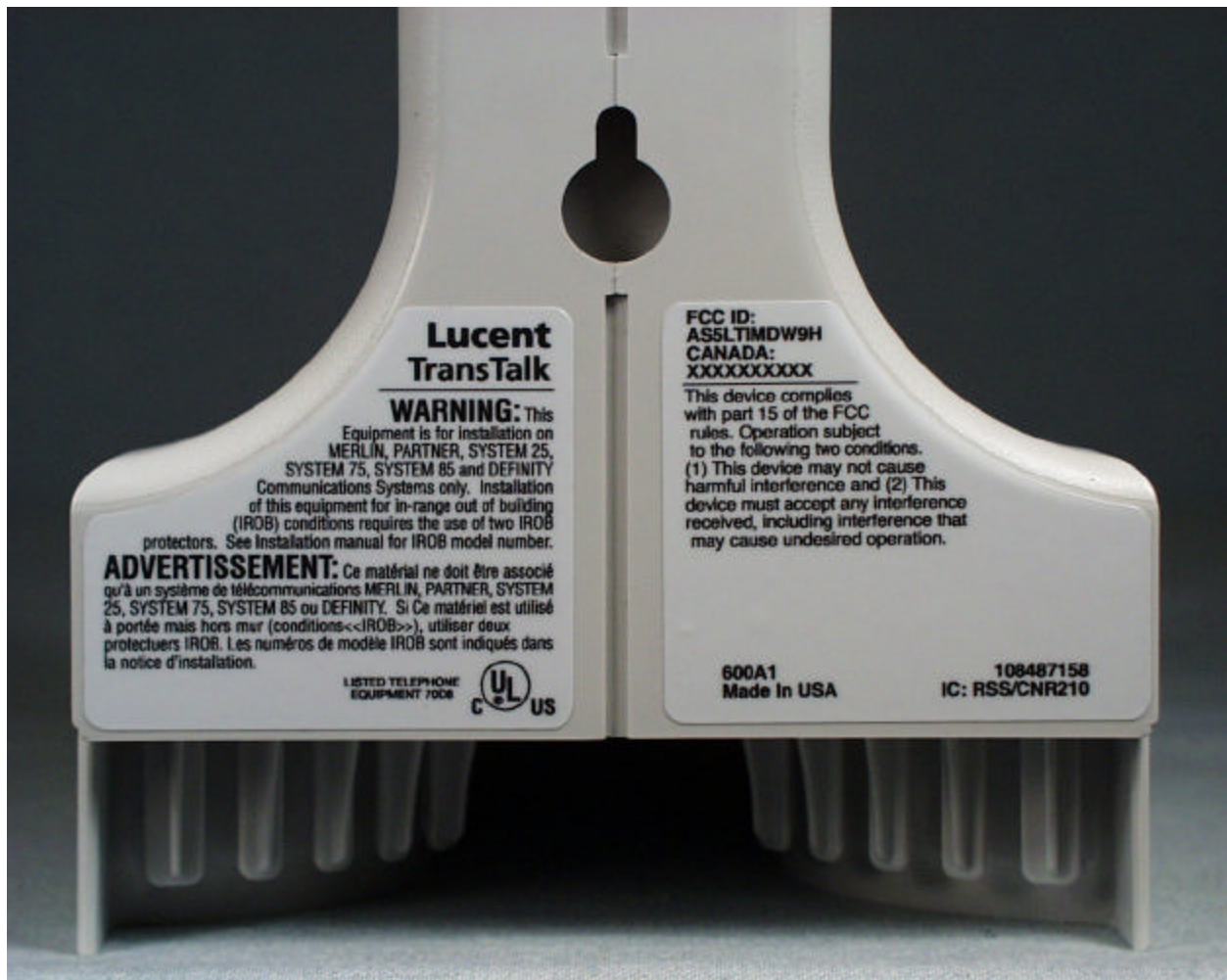
Photograph of label on the back exterior of the base.