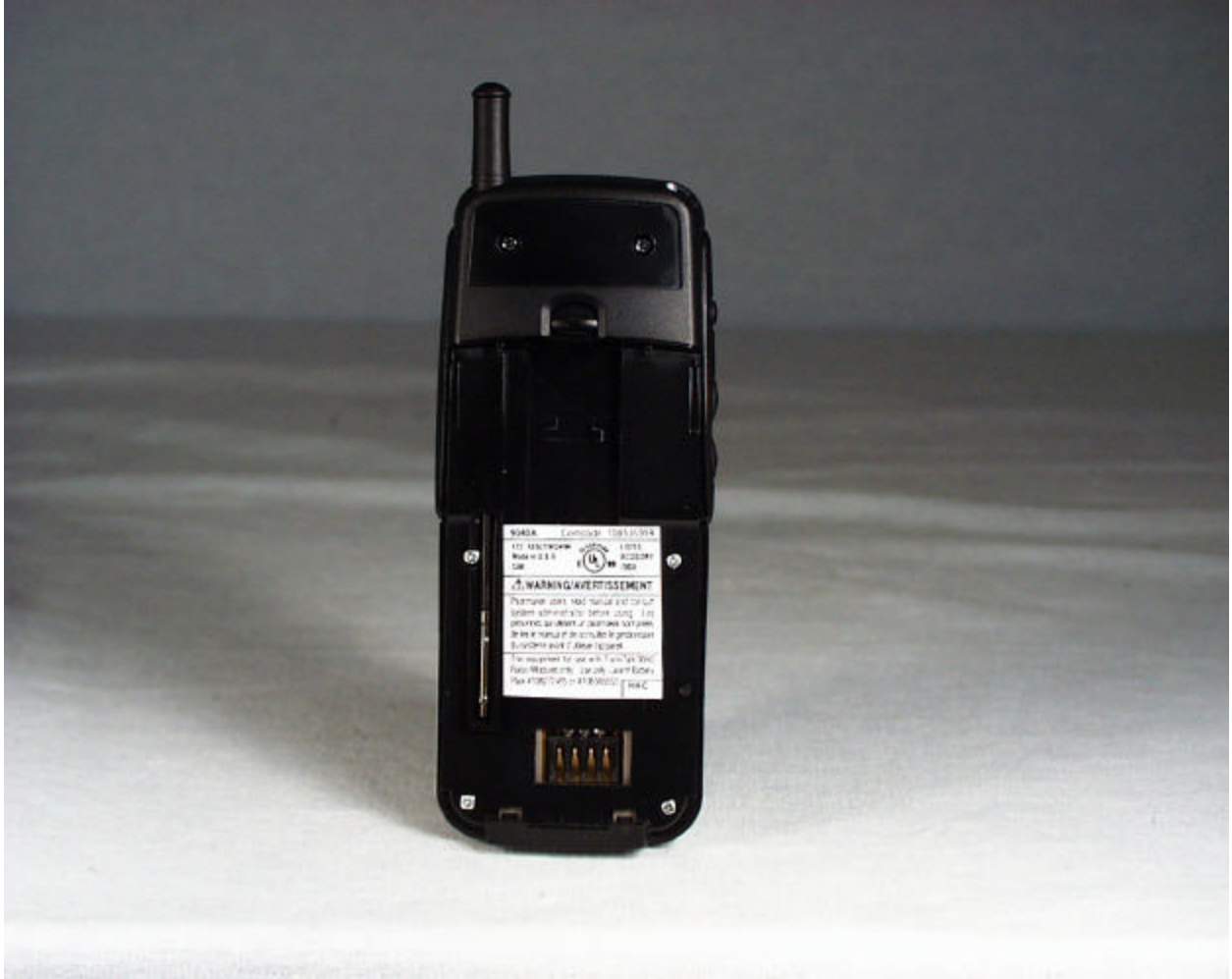
Photograph of the back exterior of the handset, showing the label placement.