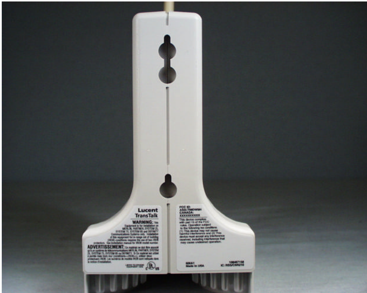
Photograph of the back exterior of the base, showing the label placement.

In accordance with the requirements of Sections 15.19 (a), 2.925 and 2.926 of the FCC Rules, the following information will be permanently affixed to the Lucent Technologies, Inc. Model MDW 9040 as shown in the photograph below. The FCC ID number is located on both the base and the handset, but due to the size of the handset the compliance statement is located only on the base.