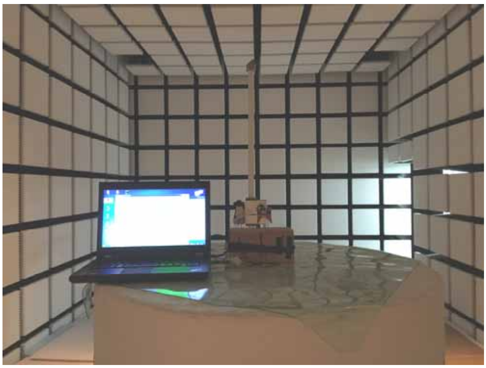
Antenna #2: WAND2DBI-SMA