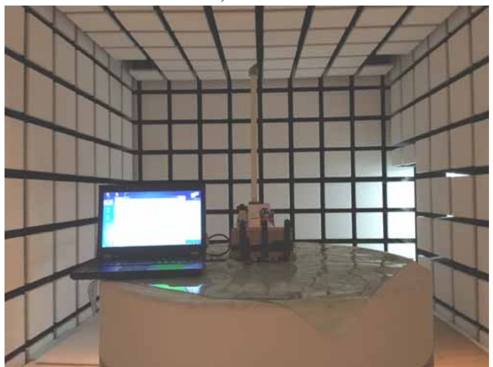
Antenna #3: WAND5DBI-SMA, Side