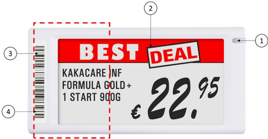
Figure 2-1 Front area of Nowa-266

The front area of Nowa-266 is shown in Figure 2-1 , and the function of each area is shown in Table 2-2 .