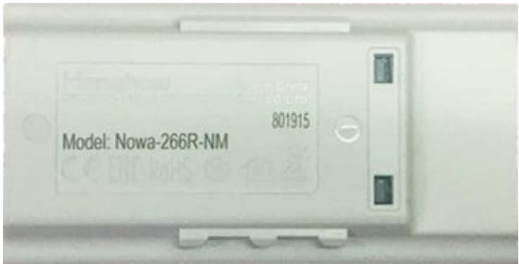
Figure 2-2 Rear panel of Nowa-266

The rear area of Nowa-266 is shown in Figure 2-2 .